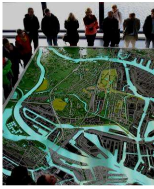
Fig. 2. Hamburg, a) a diagram of the concept of energy self-sufficiency - Wilhelmsburg 2050 Source: own elaborations and IBA data [1], b) a model of Wilhelmsburg - demonstration projects of IBA_Hamburg 2006-13, Source: own materials